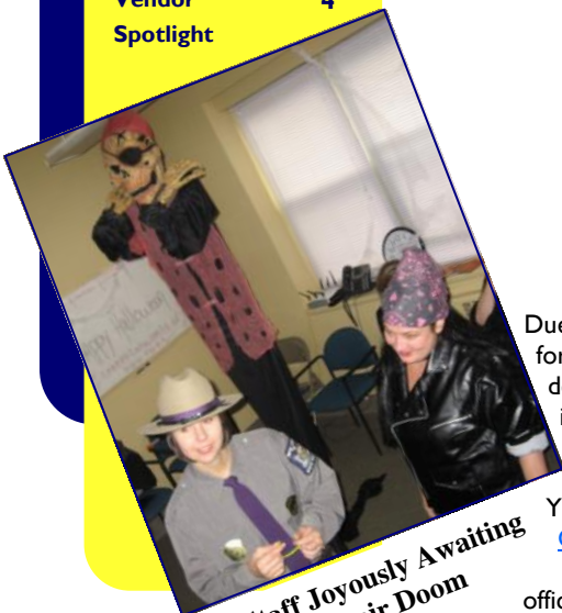
Staff Joyously Awaiting Their Doom

Although considered a success by (Continued on page 3)