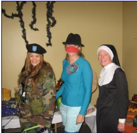
A soldier, a platypus detective, and a nun were available in case of injury.