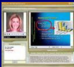
Providers can expect to log on and complete the training at times convenient to them.